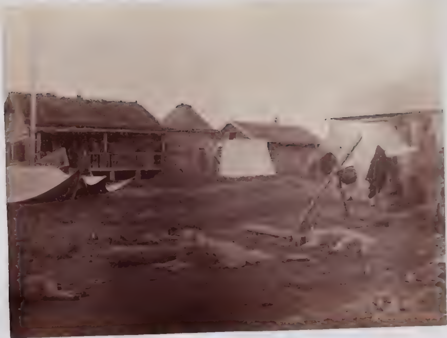
| 30. Kolmakovsky, trading post, Kuskokwim | [River.]